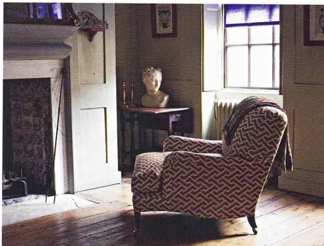
Bespoke Howard chair, £4,725 plus fabric, Max Rollitt (01962 791124; www.maxrollitt.com )

A poker is essential for the all-important pushing and prodding of logs to create the perfect blaze, but an old sword or even a bayonet will do. A log basket is also vital. Ensure it is as big as is practical, to save time going outside for more supplies and to keep some logs drying inside the house.